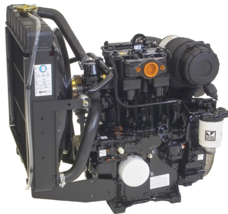
LPW2 G BUILD ENGINE